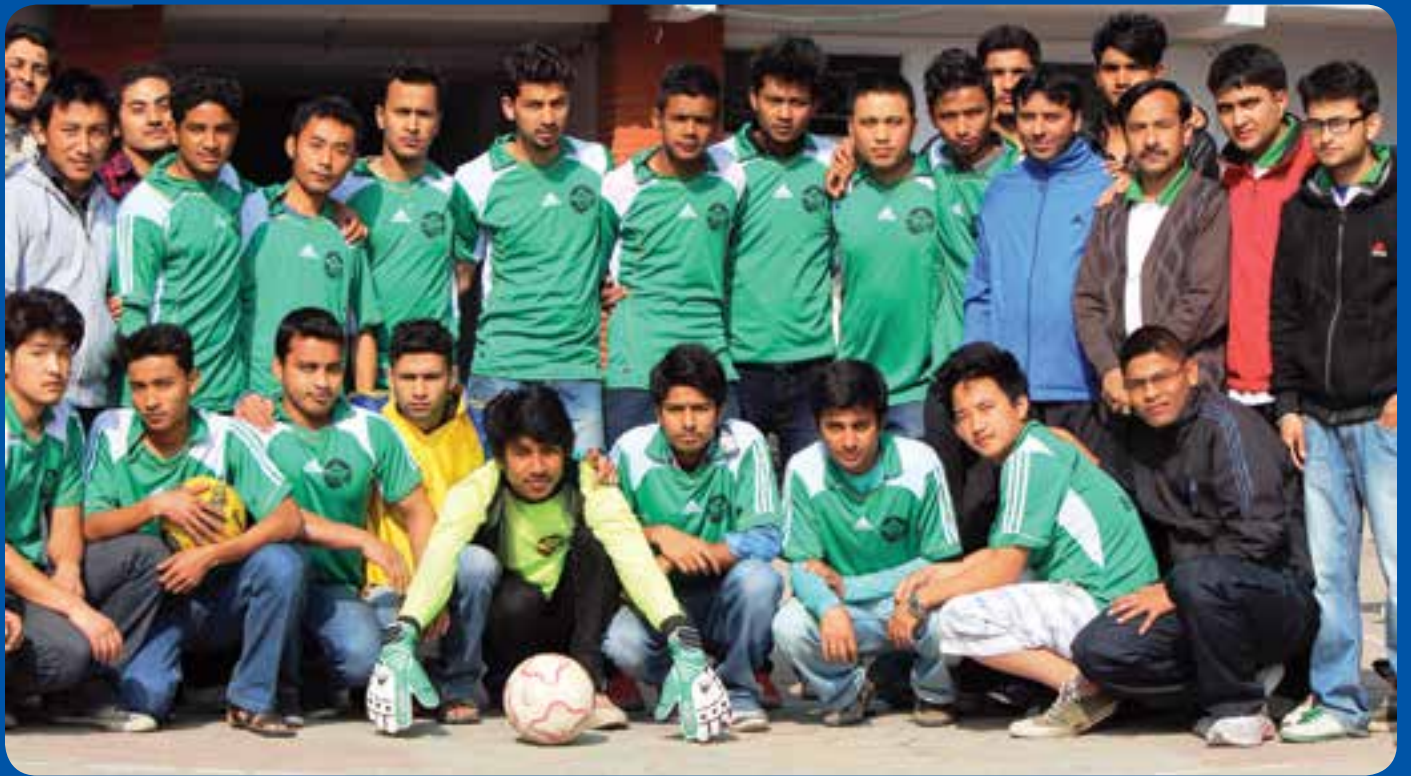
Football Team of SchEMS