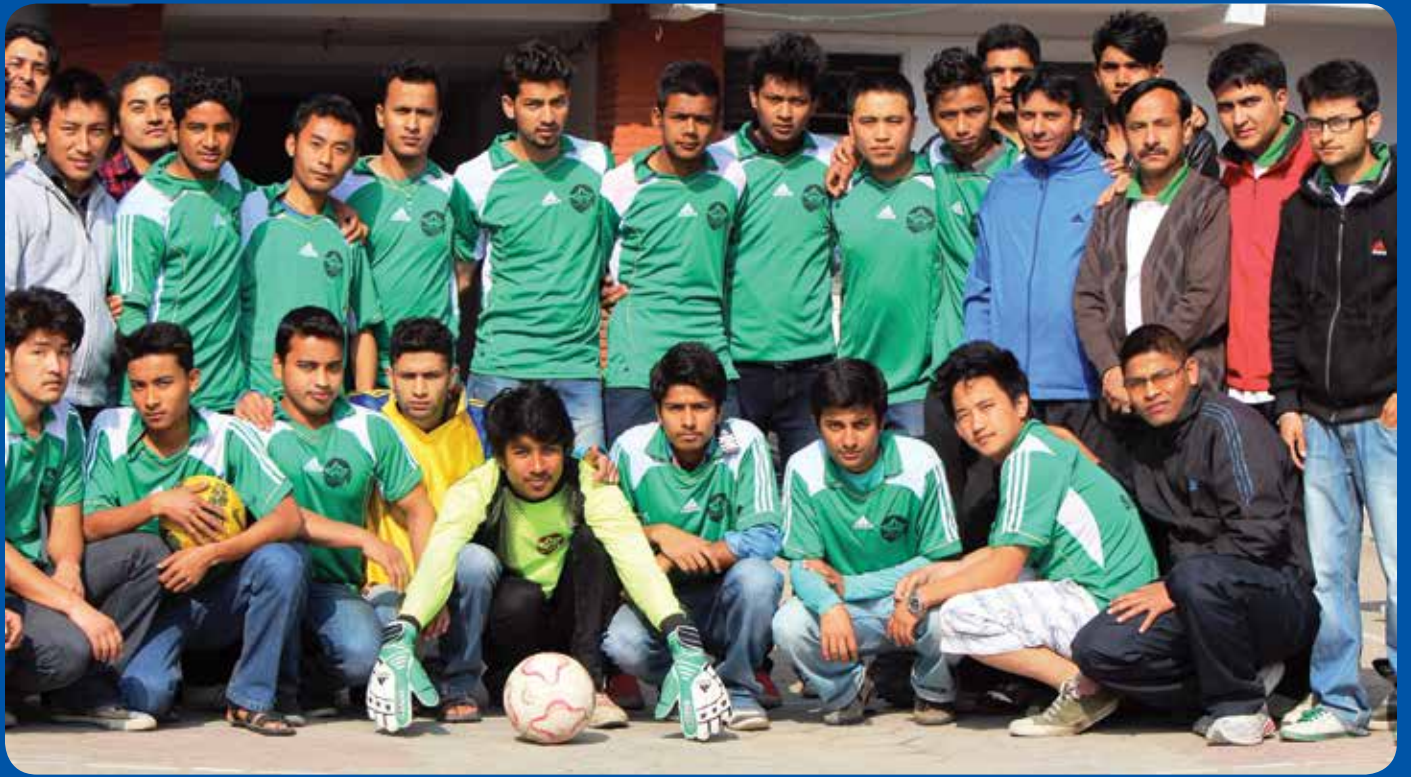
Football Team of SchEMS - 2013